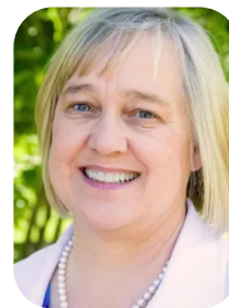
KRISTEN JURAS Lt. Governor State of Montana

“By thoroughly and carefully reviewing, rolling back and repealing unnecessary regulations, while also ensuring safeguards for public health and consumer safety, we will reduce the burden Montanans face and help more people thrive and prosper.”